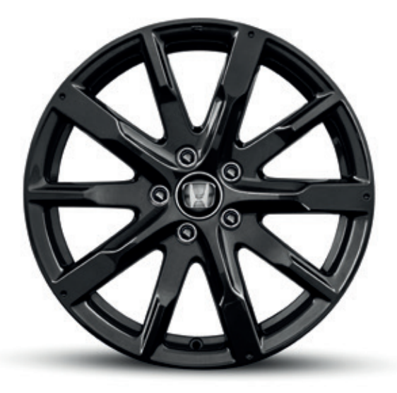
18" CR1802 ALLOY WHEEL This alloy features a full paint Gunpowder Black

This alloy comes with Gunpowder Black windows and a diamond cut A-surface with shiny clear coat.